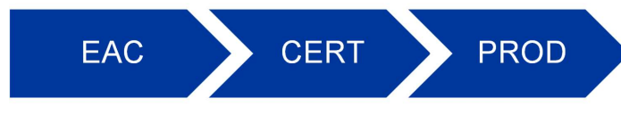
Figure 3 TIPS environments for release deployment

Prior to the deployment, the new release is first tested by the Eurosystem in the EAC environment. That is followed by user testing in the CERT environment.