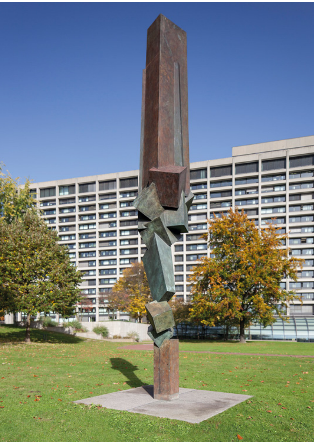
The grounds with a bronze statue by Bruce Beasley, Messenger II, 1993

The Deutsche Bundesbank is the central bank of the Federal Republic of Germany. Together with the European Central Bank (ECB) and the other central banks of the Eurosystem, it is responsible for ensuring the stability of the euro. The President of the Bundesbank is a member of the Governing Council of the ECB, which decides the euro area's monetary policy. The Bundesbank contributes towards fulfilling the Eurosystem's primary objective, which is to maintain price stability, and implements the Governing Council's decisions in Germany. Moreover, the Bundesbank plays an active role in both national and international committees and institutions working to safeguard a stable financial and monetary system. Jointly with the Federal Financial Supervisory Authority (BaFin), the Bundesbank has the additional task of supervising banks in Germany. The Bundesbank's mandate also includes ensuring the smooth settlement of payments within Germany and abroad. Through its branches, the Bundesbank puts euro cash into circulation in Germany. To perform all of these tasks, the Bundesbank employs some 9,500 staff at its nine Regional Offices, its branches and at its Central Office in Frankfurt am Main.