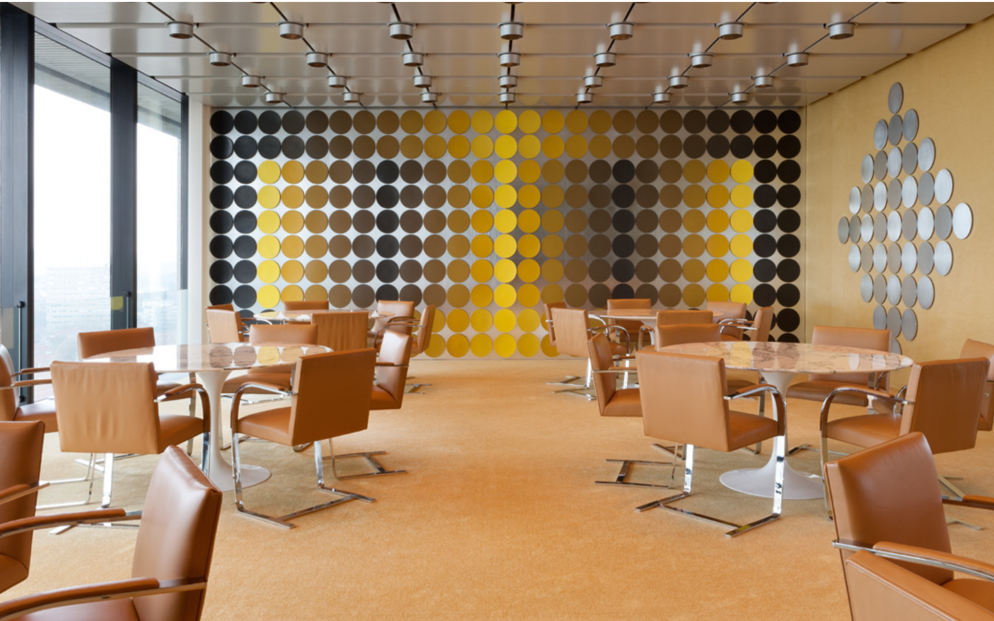
Victor Vasarely and Yvaral, interior design for dining room, 1972