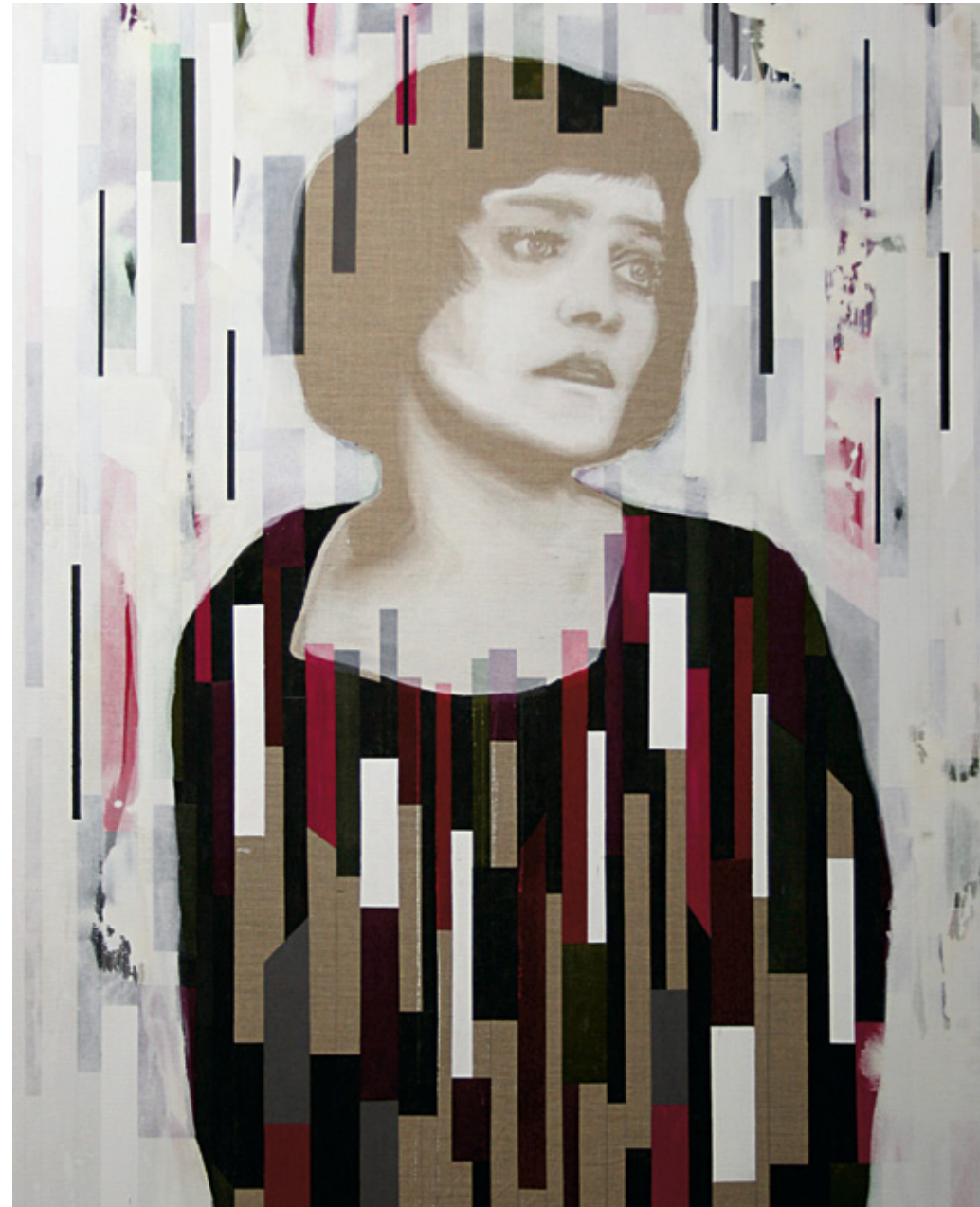
Matthias Bitzer, Red dress of rain , 2007, acrylic and ink on unprimed canvas

Because the Bundesbank buys some of the items it exhibits, contemporary works are successively added to its art collection. In 2007, the Bundesbank showcased paintings by Matthias Bitzer. His works bring together two disparate pictorial worlds: in the picture opposite, the figurative depiction of a young woman is merged with the formal idiom of abstract art, which was elaborated at the beginning of the 20th century. Viewed with historical hindsight, Bitzer fuses the geometric vocabulary of abstraction with a narrational dimension. The woman portrayed in Red dress of rain is not a fictitious person but Emmy Ball-Hennings (1885 – 1948), one of the founders of Dadaism in Zurich. Herself a protagonist of Modernism, which constantly reinvents itself, Ball-Hennings serves as a model for Bitzer, who is fascinated by the possibilities of constructing identity and presenting it aesthetically.