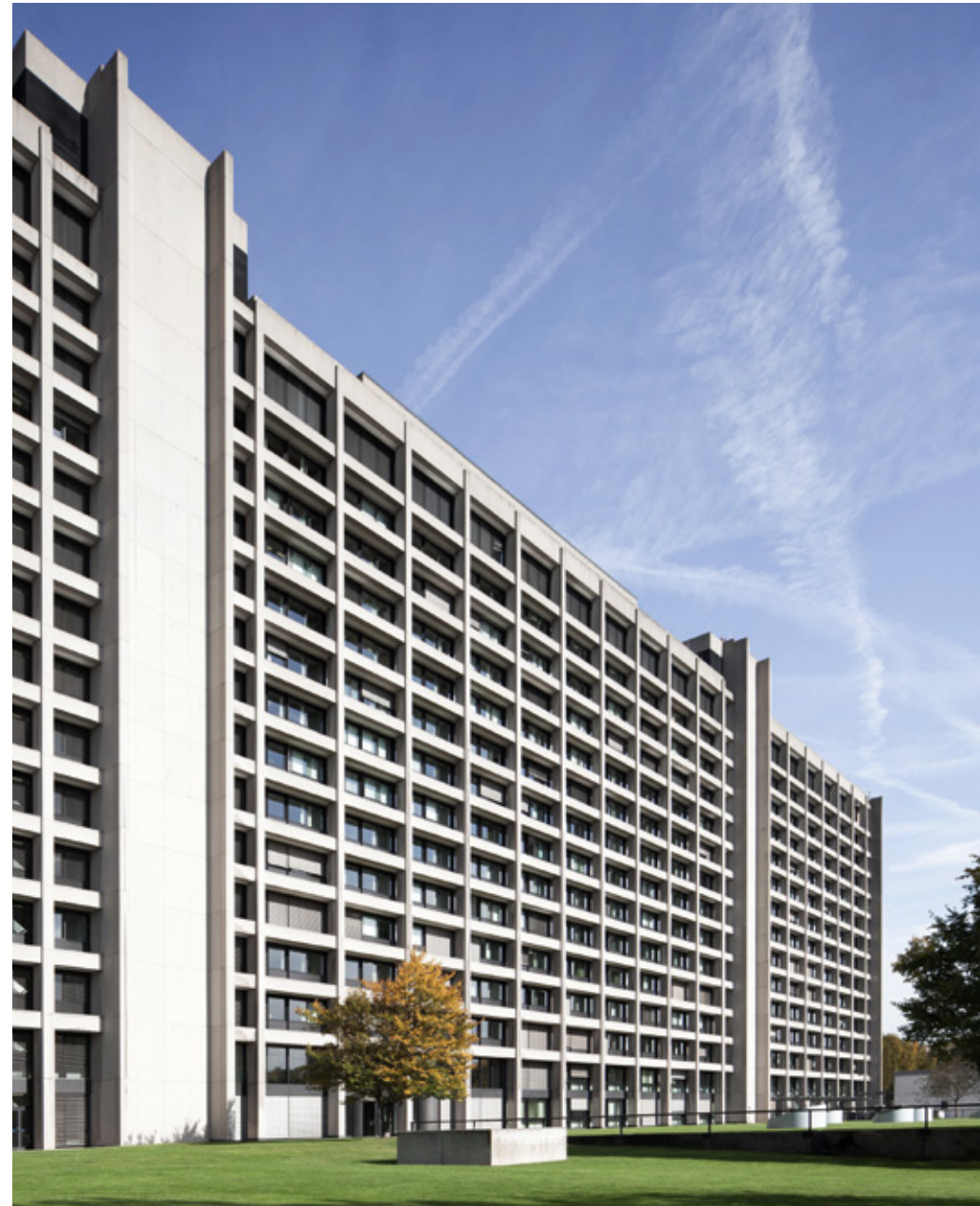
South façade of the main building

The extremely elongated building is a concrete and glass slab measuring 217 meters in length yet less than 17 metres in width. Its structure and articulation are exceptionally clear-cut. Two solid perpendicular markers housing the lift shafts optically divide the building into three sections of contrasting proportions. However, the main structural contrast lies in the vertical-horizontal tension between the two perpendicular lift shafts, which are replicated by the slender side-pillars at either end, and the lateral grid pattern of the two longitudinal façades. The façade of grey exposed concrete is accentuated, with the rows of windows with their dark metal frames receding behind this frontal grid. The resulting distance between the protruding outer frame and the indented window cavities creates a strong effect of plasticity, heightening the interplay of light and shade. This gives the building a changing spatial ambience, depending on the time of day and the light conditions. The Cash Department and Guesthouse offer variations of the main building's formal theme and supplement its long, tall outline with their own more horizontal emphasis.