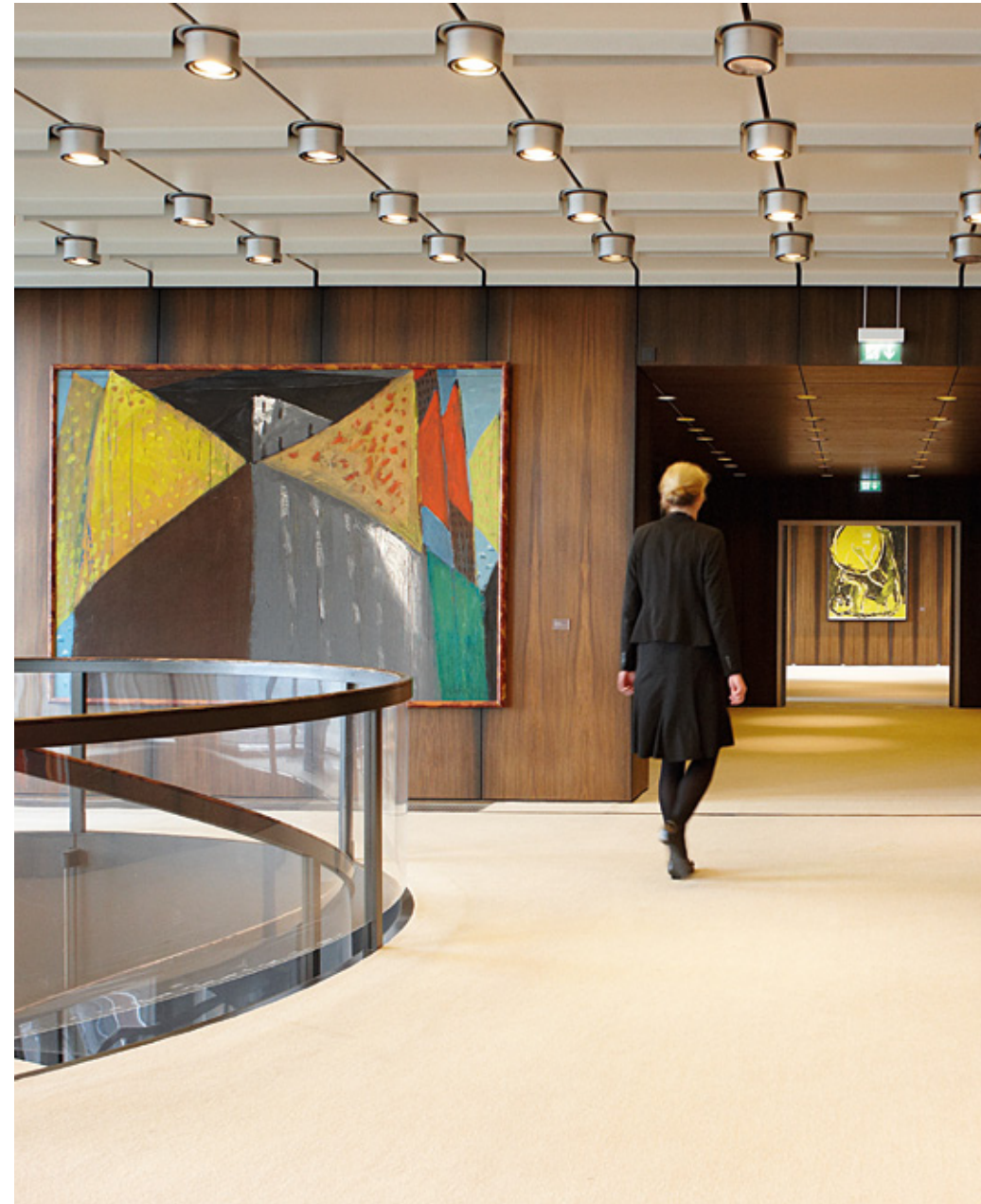
Section of the 13th floor, with paintings by Georg Baselitz and Markus Lüpertz

One of the long suite of multifunctional rooms on the 13th floor was designed by Victor Vasarely and his son, Yvaral, as a dining room. They created an artistic ensemble that is characteristic of their work: the artists strove to produce art that was both contemporary and socially relevant. One of its salient features was the pervasion of everyday life, another was the integration of artistic design into architecture. The walls are decorated with plastic and aluminium discs painted yellow, gold, grey and silver. The discs are arranged in symmetrical and mirrored configurations. The colours of the ceiling, floor and doors match those of the walls. Vasarely's artwork thus envelops the entire room and – through the interplay between materials and colours – offers the observer a wide array of perspectives.