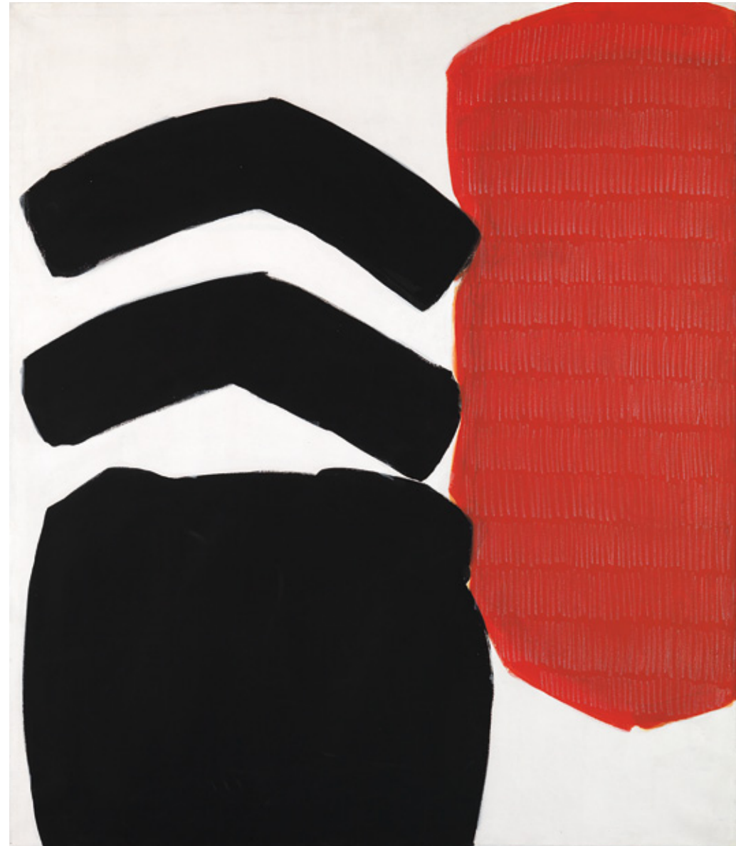
Georg Karl Pfahler, Argus, 1961, oil on canvas

Thus, the collection contains a very wide range of representational and abstract works up to the present day. Informal painting of the 1950s was one of the early focal points and features works by Karl Otto Götz and Bernard Schultze. These were in fact displayed back then at the Bank's in-house exhibitions, and collected. The subsequent painting style, which concentrates on colour and form independently of the subject, is represented in the collection by the likes of Rupprecht Geiger, Gotthard Graubner and Georg Karl Pfahler. Pfahler's painting Argus comprises large black and red shapes on a white ground. With his pictures characterised by stark contrasts, Pfahler was a pioneer of 1960s painting, combining a symbolic pictorial language with dynamic compositional principles.