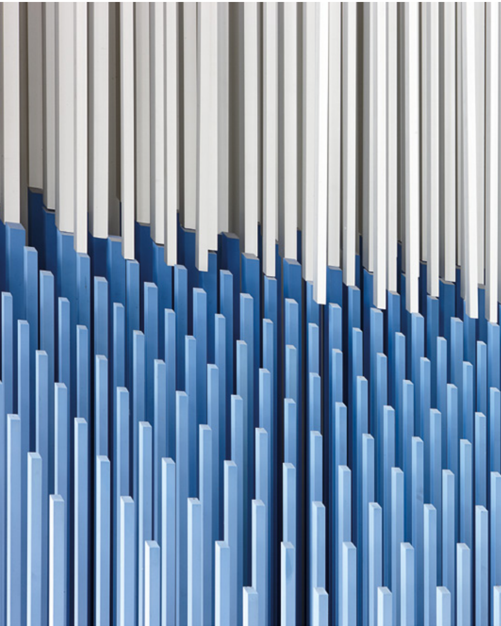
Jesús Rafael Soto, detail of the wall installation in the entrance hall

Visitors entering the Central Office foyer are surprised by the sensation of spaciousness produced by the two ceiling-to-floor glass fronts: one looking northwards to the forecourt and beyond, and the other facing south to the park. The impression of lightness inside stands in stark contrast to the massive façade outside. Jesús Rafael Soto, a Venezuelan artist who lived and worked in Paris and was one of the outstanding proponents of Op Art, created a mural sculpture and a ceiling installation with integrated luminaires for the large entrance hall. As his twin creations for the Bundesbank clearly illustrate, the artist sought to combine his interest in formal construction with kinetic rhythm. The eastern wall of the entrance hall is adorned by a sculpture fashioned from a compact arrangement of vertical metal rods in two colours. Secured either to the floor or the ceiling, they converge at the lower part of the wall. The structures appear to vibrate and evaporate as the viewer retreats, only to reform in new constellations. The variegated perspectives from different positions or angles are an integral part of the sculpture, challenging the viewer to reflect on perception. The ceiling installation, too, refashions the entrance hall's spatial geometry by optically dynamising the hall's static contours.