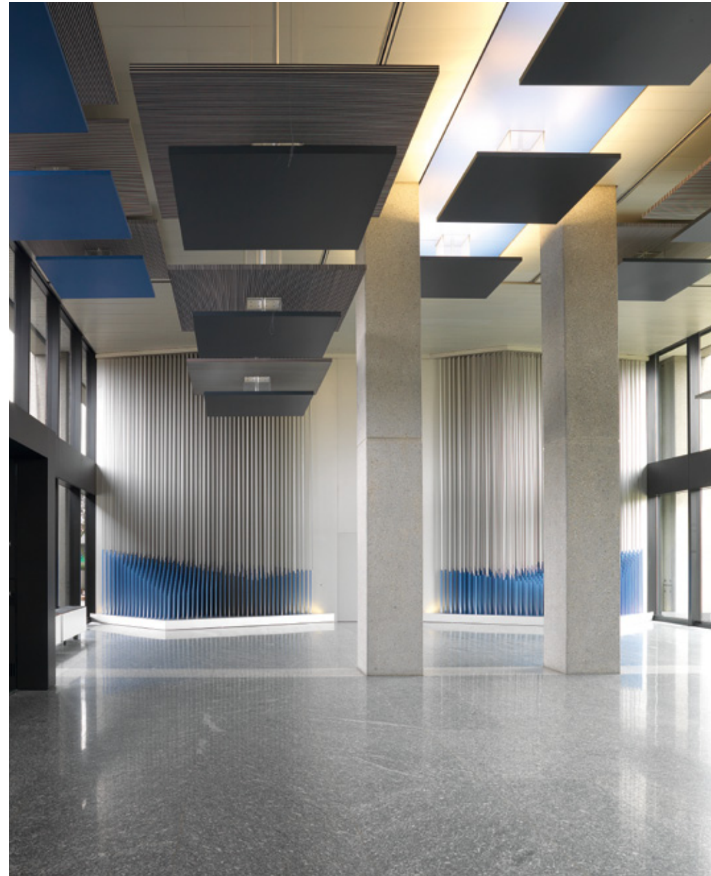
Entrance hall with an installation by Jesús Rafael Soto, 1972

While the Bundesbank Central Office was still under construction, the Bank's Executive Board sought to complement the stringently modern building with artworks that shared a uniform concept. In 1969 the Bank set up an art advisory council, which included the architects, tasked with giving particular consideration to contemporary developments in art. The minutes of the advisory board's meeting in 1969 state that "there is an agreed notion and desire to give the entire building an atmosphere that is open to what is new by introducing artworks of our time". Three architecture-related works were ultimately commissioned: an installation by Jesús Rafael Soto, a room designed by Victor Vasarely, and two large tapestries based on designs by Max Ernst.