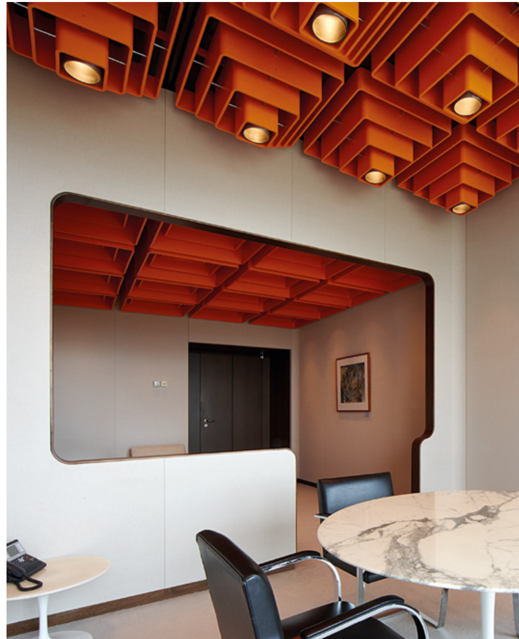
View of a conference room

To the north, in front of the Money Museum, visitors cannot fail to see a monumental, sprawling steel object by the sculptor Erich Hauser. In this geometrically abstract work of industrially manufactured steel parts, Hauser presents a variation on the themes at the heart of his work – statics, dynamics and balance – and places them in relation to the modern façade of the architecture of the museum building. The Central Office grounds also contain works by Gerhard Marcks and Joan Miró.